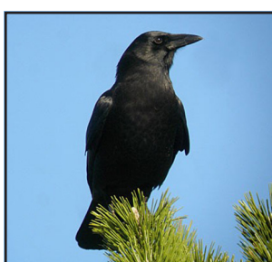
American Crow.