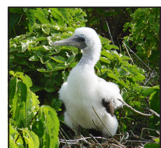
Red-footed Booby Baby.