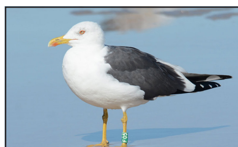
Lesser Black-backed Gull (adult).