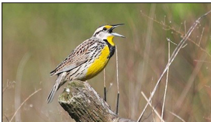
Eastern Meadowlark.