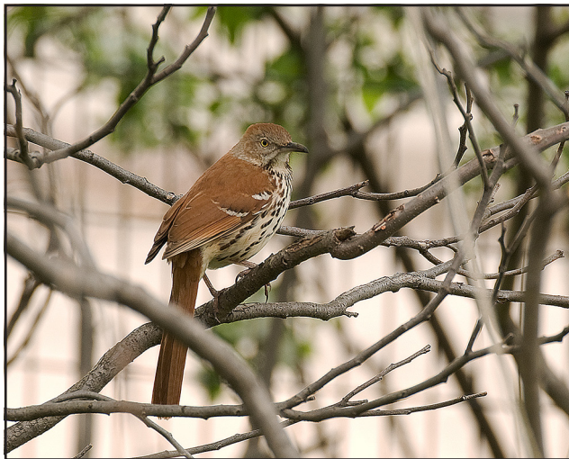
Brown Thrasher.