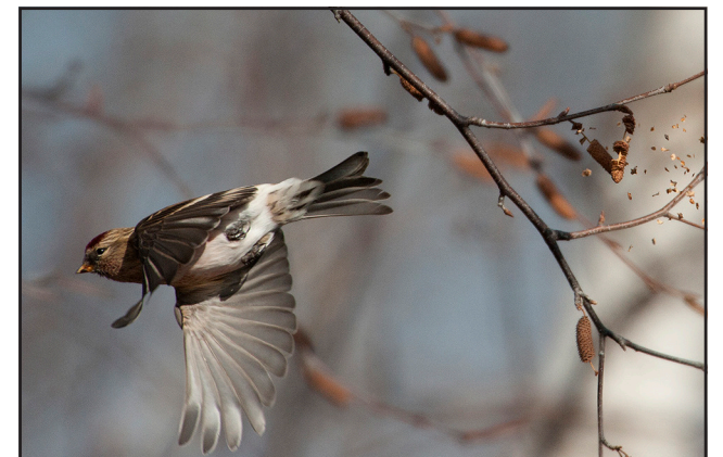
Common Redpoll.

Chicago Audubon's Birding America XI Symposium, Saturday, March 19, is still open for registration.