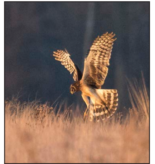
Northern Harrier.

(Read further at: audubon.org/news/white-house-warming-world-bake and “Birds Tell Us That We Need To Act On Climate” at tinyurl.com/audubon-climate-action .)