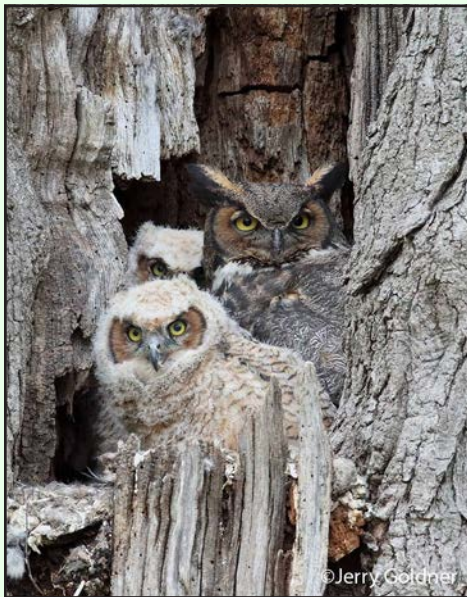
Great Horned Owl with chicks.