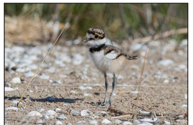
Killdeer chick.