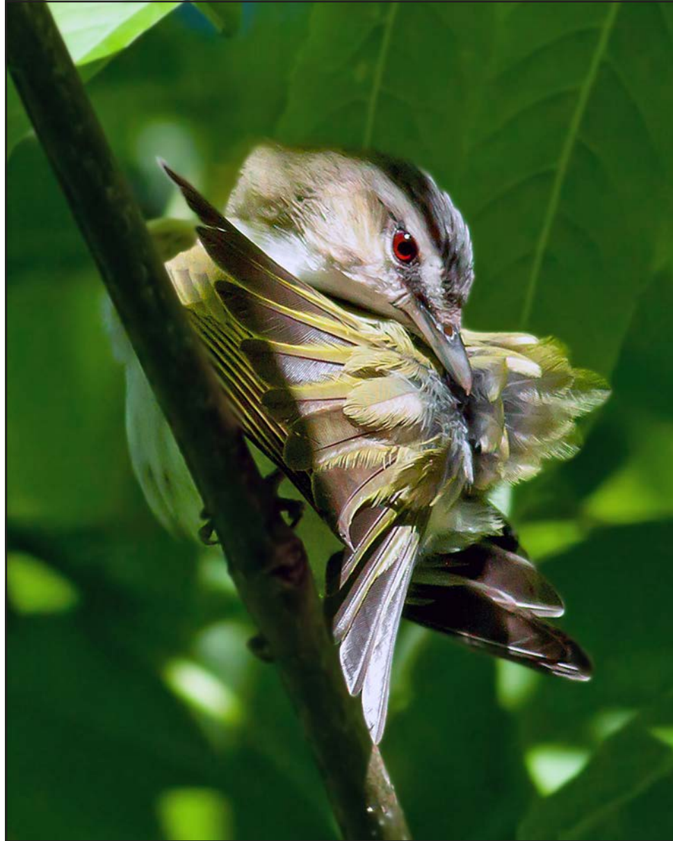
Red-eyed Vireo.