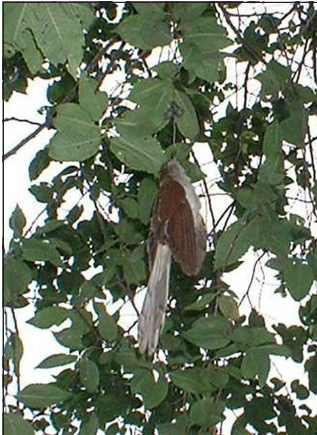
Entangled Black-billed Cuckoo.

build your bird-watcher Life List, but a night heron and other wildlife have been rescued from fishing line at the Nature Center. Many of us have seen and perhaps helped untangle wildlife in similar public fishing areas. For an alarming and distressing look at this too often overlooked hazard, do a search for "fishing line and wildlife." You will find many dis-