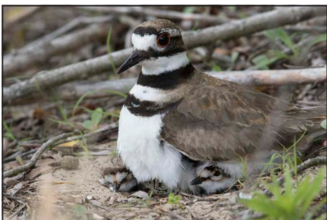
Killdeer on chicks.

This is an important fundraiser for Chicago Audubon. Alert family and friends!