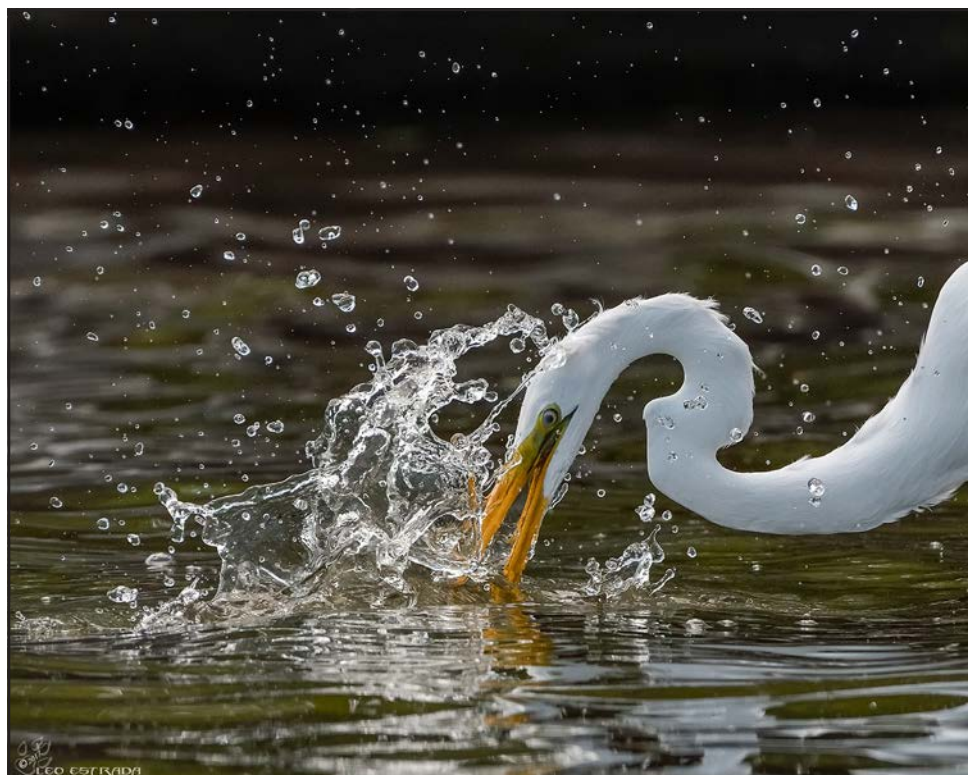
Great Egret.

Third Place Winner. Congratulations, Leonardo Estrada! Great Egret.