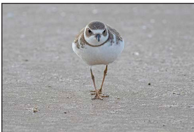
Semipalmated Plover.