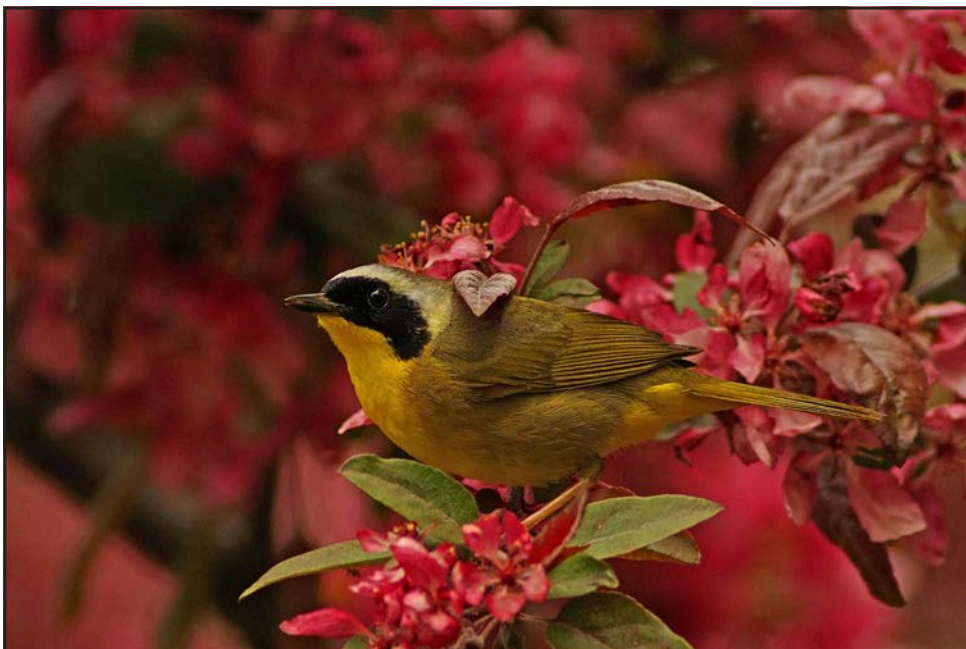
Common Yellowthroat.