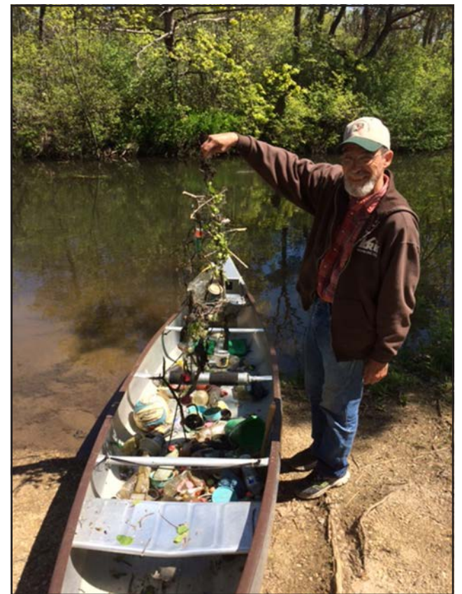
Wildwood entangled trash.

turbing pictures and articles from local organizations, including ours ( www.chicagoaudubon.org/content/untangling-hazards-fishing-line ).