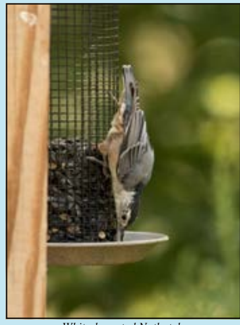
White-breasted Nuthatch.

will be published in the next newsletter and on our website (chicagoaudubon.org).