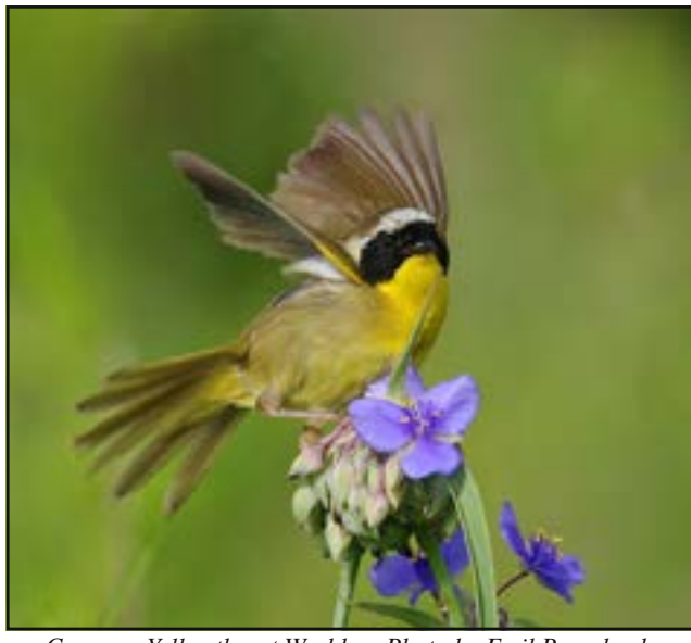
Common Yellowthroat Warbler.

the environmental underpinnings of children's stories and discuss how classic children's stories can provide a complete guide to environmental literacy. Please join us for socializing at 7:00 p.m. Program begins at 7:15 p.m. If you have questions or need directions, call Chicago Audubon's office at 773-539-6793. Everyone is welcome!