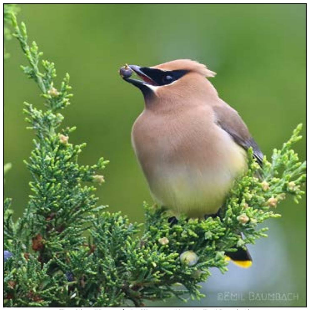
First Place Winner: Cedar Waxwing.

Many thanks to all who participated in the 2018 spring photo contest. Extra special thanks to Jerry Goldner who proposed the photo contest a few years ago, and has done so much to make it a success.