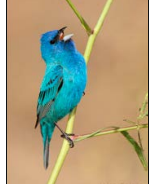
Indigo Bunting.

A male Indigo Bunting learns his songs from nearby adult males, but not his own father. Because of that, adult males that are a few hundred yards apart from each other generally sing different songs, while those in the same "song neighborhood" share nearly identical songs. They sing as many as