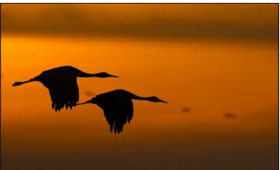
Sandhill Cranes.