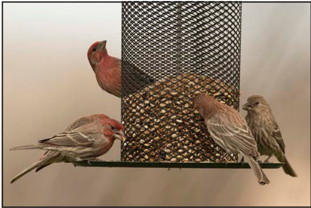
House Finches.