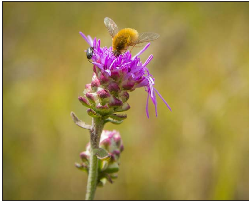
Bee Fly on Blazing Star. "Bee Fly" by Brett Whaley is licensed under CC BY-NC 2.0.

One small pine tree stands along what was once the perimeter of the Civilian Conservation Corp (CCC) of Camp Pine. It is most unlikely the tree was there in the 1930's when the camp was built. I haven't found the source of the name or what projects the men worked on. We do know the site now is home to a diverse remnant prairie and shrub community that is prime habitat for breeding bird specialists. This spring and summer, CAS found Field Sparrows, Common Yellowthroats, Catbirds, Brown Thrashers, Blue-winged Warbler and Willow Flycatcher, along with many others. Past sightings