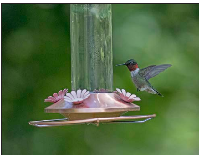
Ruby-throated Hummingbird.

Saturday, September 9 (9:00 a.m.). Chicago Audubon Seed Collecting at Camp Pine Woods Forest Preserve, Glenview/Des Plaines. Come join the chance to help a prairie and shrubland become an even better habitat for native plants and wildlife. Help collect native seeds for redistributing on site. Camp Pine Woods is on Euclid/Lake Avenue