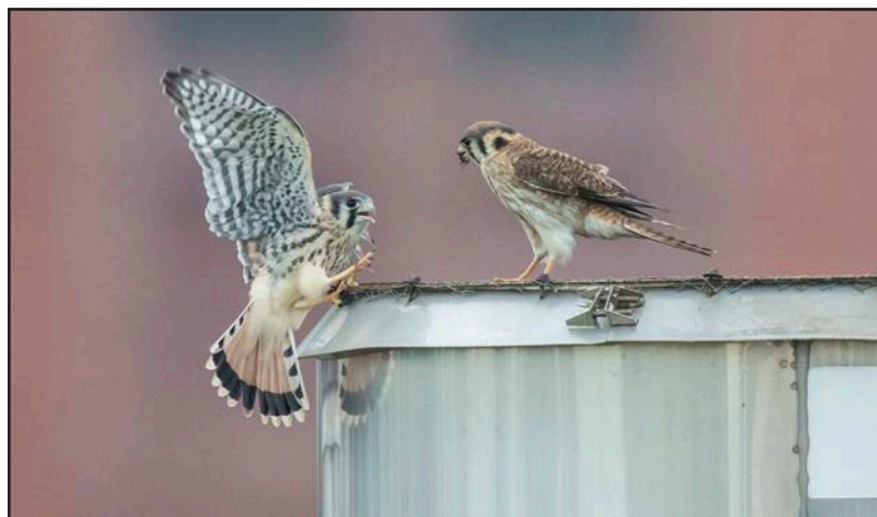
American Kestrels on downtown Chicago rooftop.