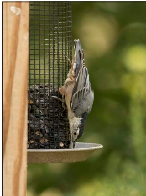
White-breasted Nuthatch.

Administrator will return your call as soon as possible. Also, please note that every year, as a courtesy to our purchasers, everyone who has placed an order will be called a few days in advance of the pickup date to remind you of the upcoming date and time. If you are unable to pick up your order on October 28, please make arrangements