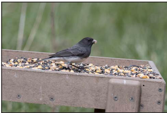
Slate-colored Junco.