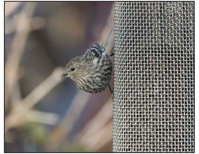
Pine Siskin.

Saturday, October 7 (9:00 a.m.). Chicago Audubon Seed Collecting at Camp Pine Woods Forest Preserve, Glenview/Des Plaines. Come join the chance to help a prairie and shrubland become an even better habitat for native plants and wildlife. Help collect native seeds for redistributing on site. Camp Pine Woods is on Euclid/Lake Avenue between Des Plaines and Glenview, just east of the Des Plaines River. Enter from east bound; no left turn from west bound. Contact John Elliott at johnelliott4@gmail.com .