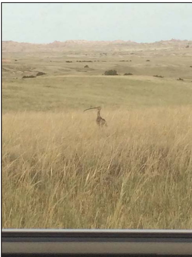
Long-billed Curlew. Badlands of South Dakota, June 2017.