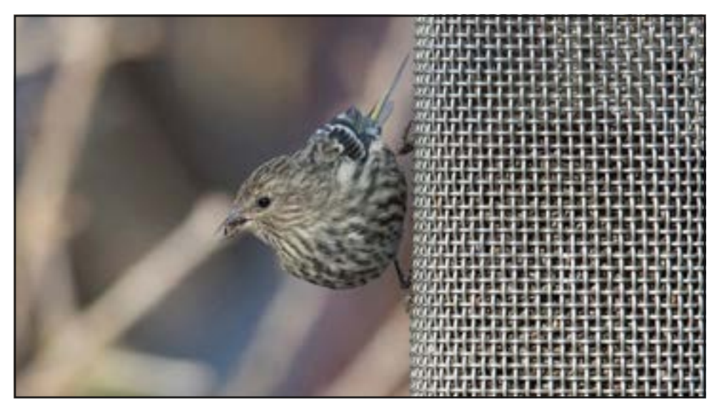
Pine Siskin.