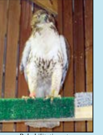
Rehabilitation at Willowbrook Wildlife Center.

Either in pursuit of prey, attracted by something on the other side of the window, or fooled by a reflection, this female Red-tailed Hawk broke through the double pane glass of a suburban front window. Home security alarms alerted the family of a break-in to their home. When they found this very large bird of prey in their living room, they called Chicago Bird Collision Monitors who safely rescued the bird and took it to Willowbrook Wildlife Center. The hawk was evaluated and found to have only minor injuries. Amazing, considering the force with which it must have hit to break the heavy glass! (Photos and caption courtesy of CBCM's website: birdmonitors.net)