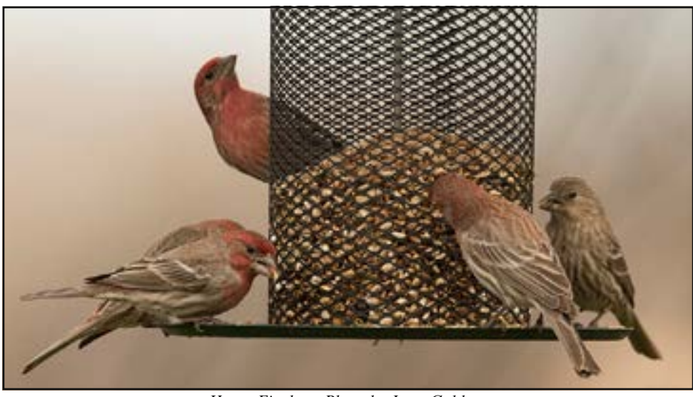
House Finches.