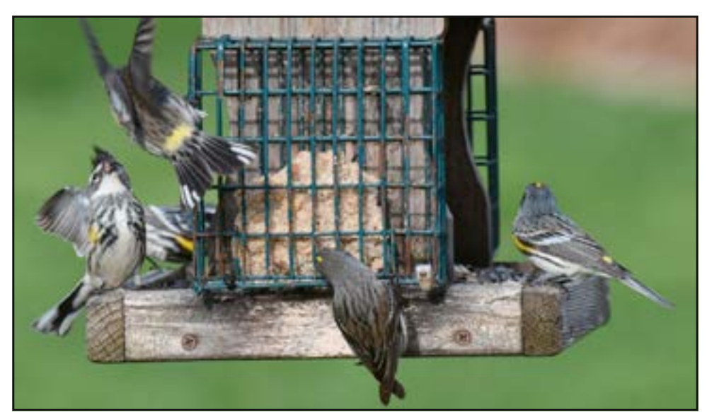
Yellow-rumped Warblers.

The researchers gathered data from two sets of feeders: a set that had gathered debris from normal feeding activity and a set of unused, clean feeders. They applied cultures of Salmonella to the entire perch and seed well areas of each feeder and then measured the concentration of bacteria on the feeder. The researchers tested three cleaning methods: scrubbing feeders with soap and water, soaking them in a diluted bleach solution for ten minutes, and scrubbing them with soap and water