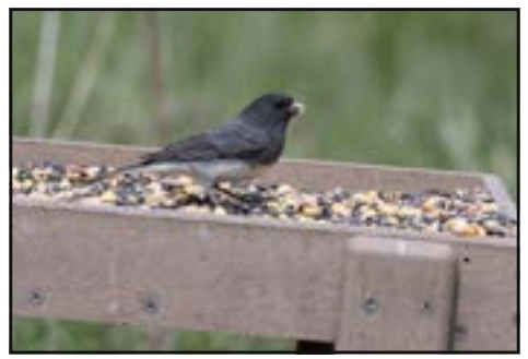
Dark-eyed Junco.