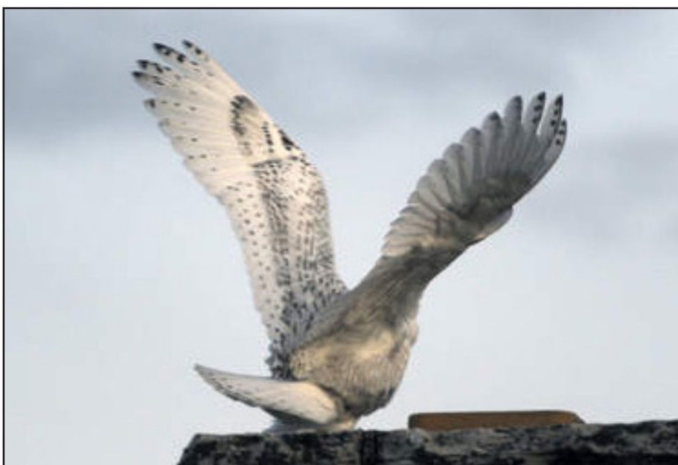
Snowy Owl. Montrose Point.