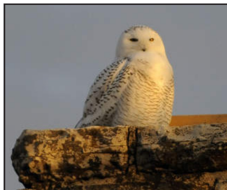
Snowy Owl. Montrose Point.