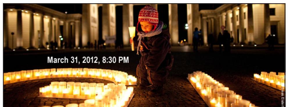
March 31, 2012, 8:30 PM