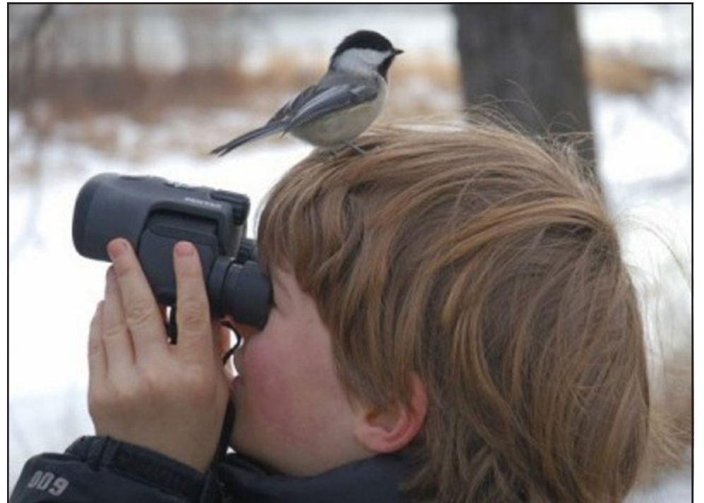
Black-capped Chickadee avoiding birdwatcher.