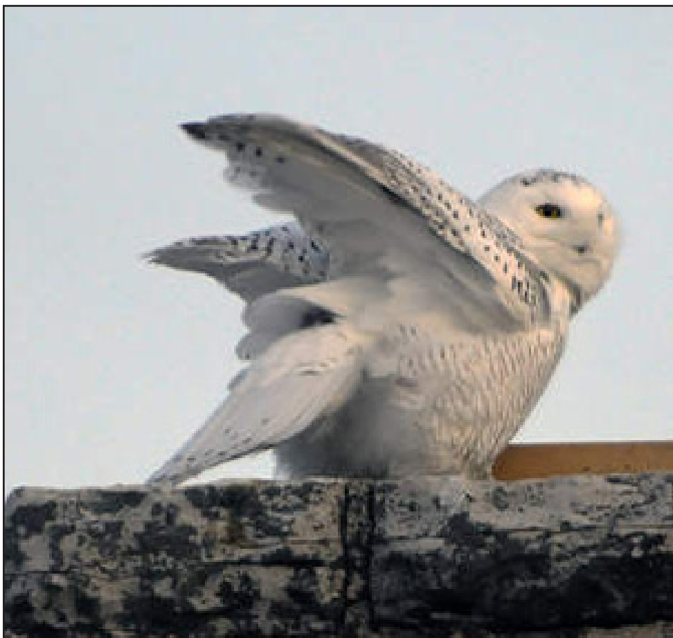
Snowy Owl. Montrose Point.

all across the country by the thousands—from Boston to the Great Lakes, from southern United States up to Vancouver. Ninety showed up in Kansas, so you can image the excitement! Their diet is varied, consisting of everything from mice, voles and ducks, to even fish. But primarily they eat lemmings, a small rodent which had a population boom, but then the population crashed. Because of the initial boom in the lemming population, the Owls had a good breeding year last year, but then the sudden decline in lemming population may have been the cause of the huge exodus to search for food—causing a Snowy Owl irruption as never seen before!