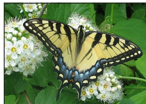
Tiger Swallowtail.

*Current board member who has been re-nominated for another term.