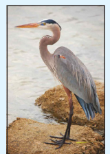
Great Blue Heron.

The Compass can be read and enjoyed in color on our website, chicagoaudubon.org . Just click on the word "Compass" in the top row of links on the homepage to visit our archives. Don't miss these wonderful birds in living color!